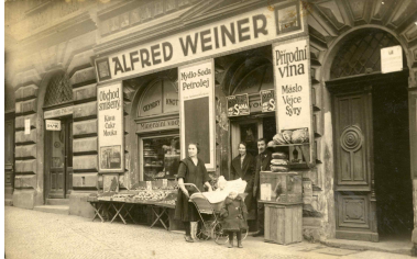
The Weiner family shop 1923